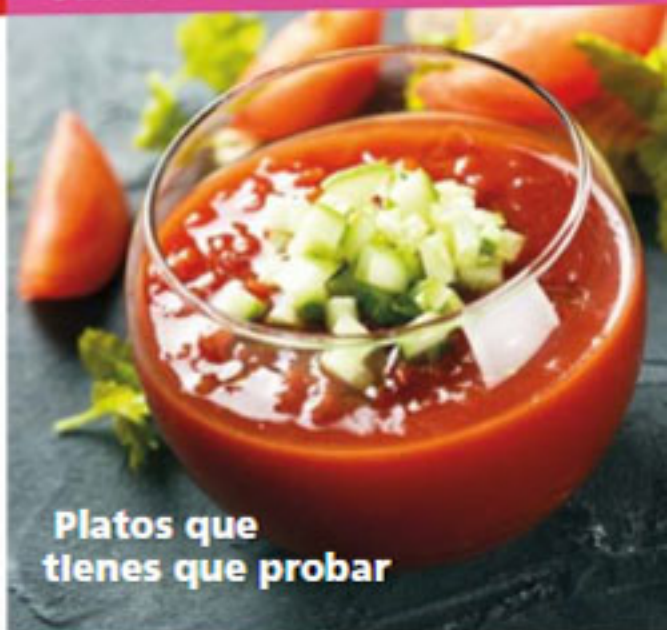
Platos que tienes que probar